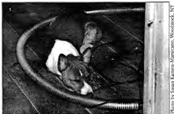
Helping with the vacuuming...

It is with the deepest gratitude that I accept your nomination to lifetime membership in the Basenji Club of America. ( Continued )