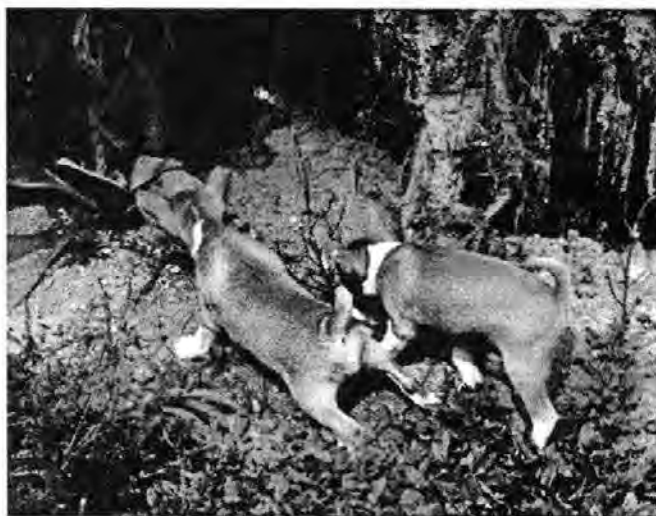
Any lions in here?

One important thing to note here is that NONE of the babies went potty outside on that first day. They “saved” it for the newspapers in the house. Wasn't that the whole point in getting them to go outside in the first place? ~