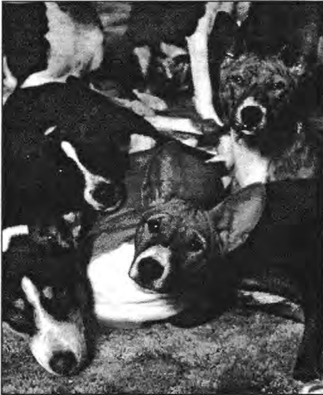
All the better to hear you with...