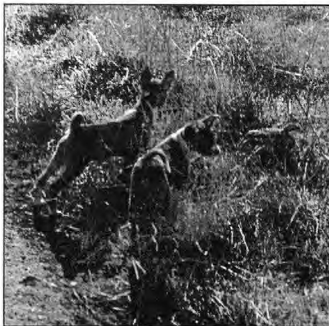
First day in the field

The longer they were out, the braver they got, and the harder they played—jumping, tumbling, chasing each others' tails. When it was time for them to come in, they were racing about the yard like demons possessed and having way too much fun to respond to my calls. Anything that was at eye level had to be completely investigated and thoroughly