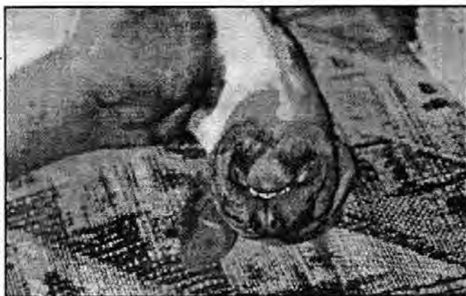
Position is everything