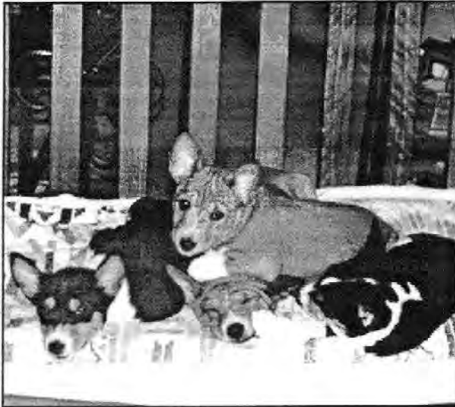
"Pig-pile" on brother!