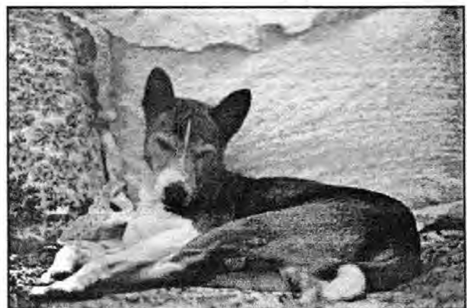
Flash at age 15

One of our members, having had a couple of older Basenjies with serious and painful disk problems in their neck, has shifted over to walking Basenjies on a martingale collar such as the Greyhound rescue folks use. It provides limited choke action and appears to be easier on their neck. New England Syrum 1-(800)-637-3786 carries them. Call for catalog.