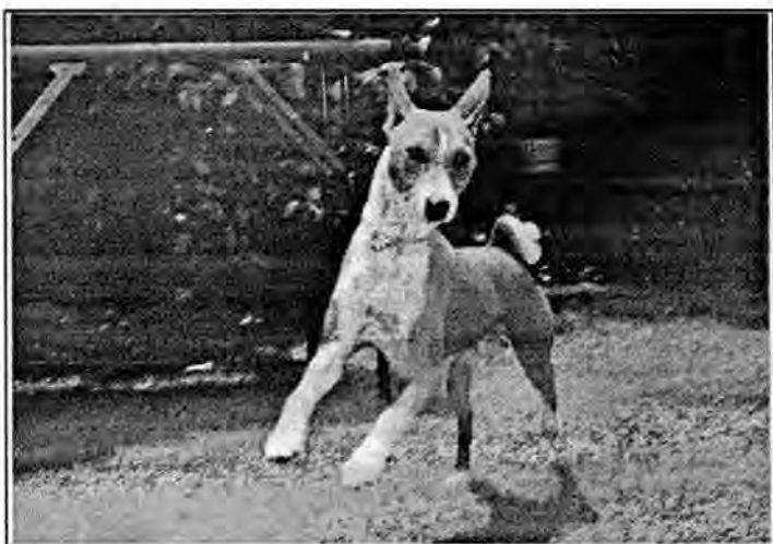
"Carousel ride anyone?"