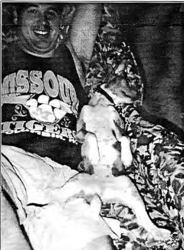
"Hali" & Dad

According to a recent USDA "APHIS" report: "Animals at 17 of the 22 licenses (dog breeding) facilities we visited were not properly identified. In addition, 14 of 22 facilities did not maintain sufficient inventory records on their animals. ...We found that for 14 of 22 licensed dealer facilities