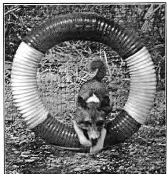
L. & R. — "Hustle" doing jumps