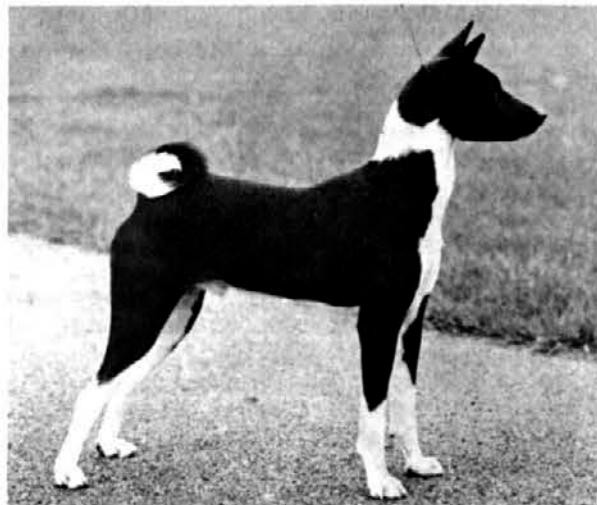
RIDINGSGOLD SIR BUNTAR OF HORSLEY