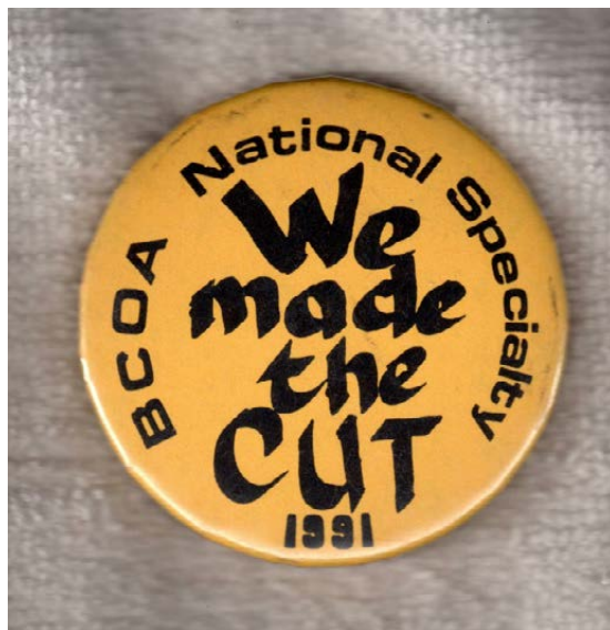
1991 – The host group designed and presented the first edition at the National Specialty in North Carolina