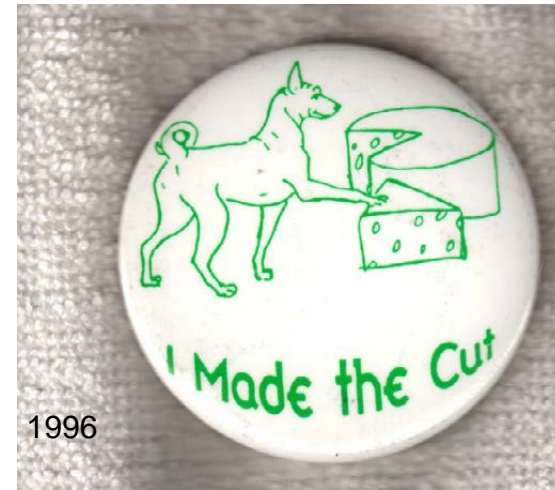
1996 was designed and made by the host group in Wisconsin