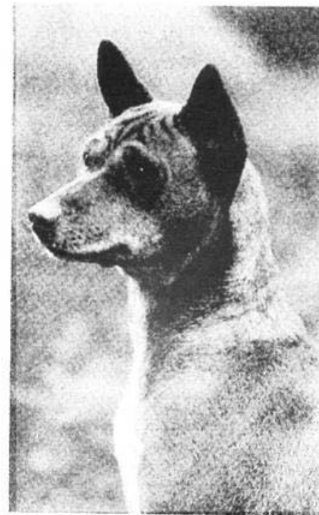
Wrinkles on the forehead are among the characteristics of the Basenji. They may be seen plainly in this picture of Bereké

“What good would a barkless dog be as a guard?”