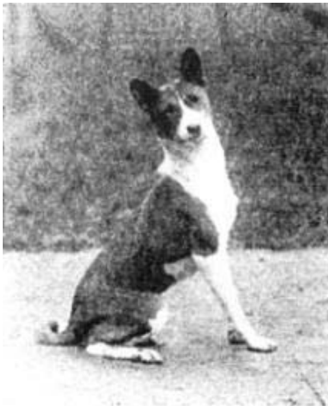
Fo-rie is a smooth Basenji. The coat is short and has a great sheen. The author is the breeder

Seven years ago, I went out to the Congo to join my husband, trekking into the interior among native who had hardly ever seen a white woman. Everywhere in the villages were to be found these alert little chestnut dogs, the best ones on the plateau among the war-like or hunting tribes, such as the Bapendi. These people, as recently as four years ago, cut up a Belgian, and distributed bits of him among the villages, thus starting a war and much bloodshed.