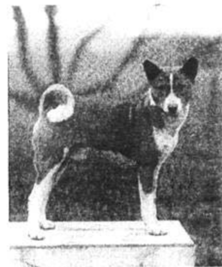
There is something “foxy” about the head of a Basenji. Note the fullness of the skull

There is a replica of a Basenji in the Giza Museum Cairo; another from the 12 th Egyptian dynasty; and a dog very similar is to be seen chasing an antelope, on a disk recently excavated from the tomb at Sakkhara, under the auspices of the well known American archaeologist, Walter B. Emery.