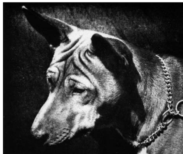
Tahzu above and litter mate Kopagi below.