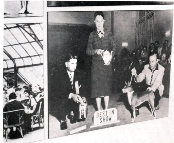
Editor's note: It would appear to be Am. Can. Ch. Dainty Dancer of Glenairley who was from Victoria! What a find!