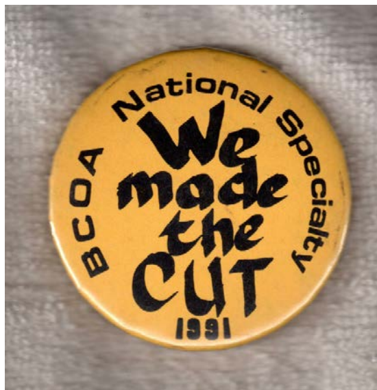
1991 – The host group designed and presented the first edition at the National Specialty in North Carolina