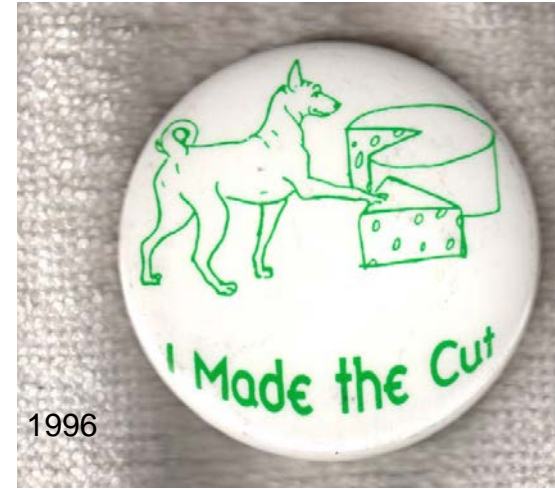
1996 was designed and made by the host group in Wisconsin