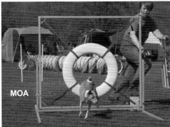
Int & Nord Ch Yulara Desert Pea Top winning bitch 1997, Top winning veteran 2004,2004 First basenji ever to win an agility competition at a FCI Int show in Scandinavia First basenji to win a first prize in obedience in Sweden