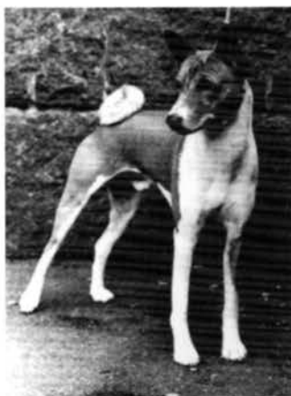
Int & Nord Ch Azenda Ful-Of-It