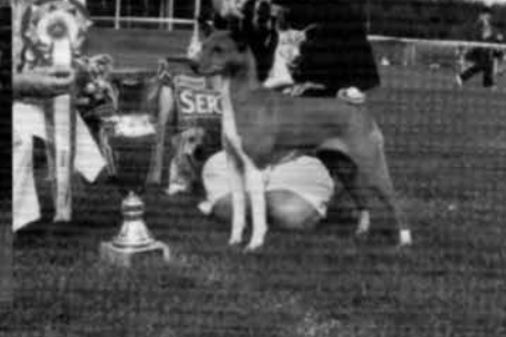
Ch Yulara Itchika Top winning bitch Sweden 2005