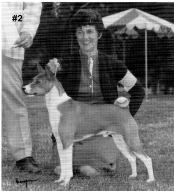
#2 CH Kazor's Dandy Deerstalker