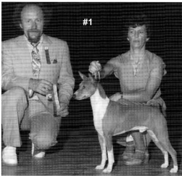
#1 Kazor's Watsie Kengo